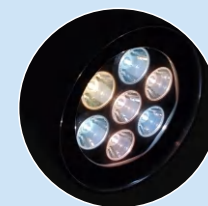
7 pcs LED light source