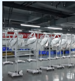
Aging of product

Add: Mplent Optoelectronics Medical Industrial Park, NO.15, Liujiao Pavilion Road, Langli Street, Changsha City, Hunan Province, China