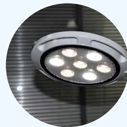
7pcs LED light source

Adjustable color temperature provides soft, uniform, and non-glaring light; enhanced by fine optical lenses, achieving both low power consumption and high luminous efficiency, energy-saving and bright light.