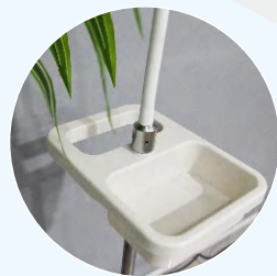
Push Hand Box