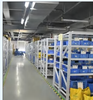
Raw materials warehouse